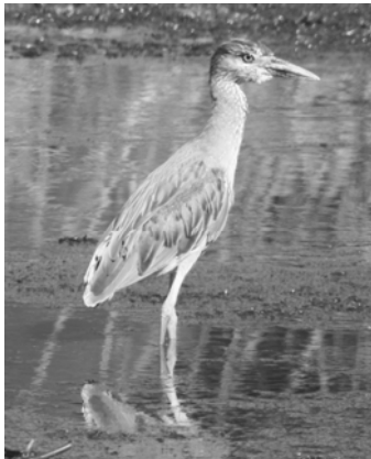
Immature Yellow Crowned Night Heron

Even though the willows are showing some damage from disease and drought, the warblers and vireos continue to show at the south end of the Slough. A Plumbeous Vireo was again seen this year in the spring and again this fall. The channel-side Light-footed Clapper Rail was seen several times this summer by various work parties, and a pair of Kingfishers are starting a nest in the area this year.