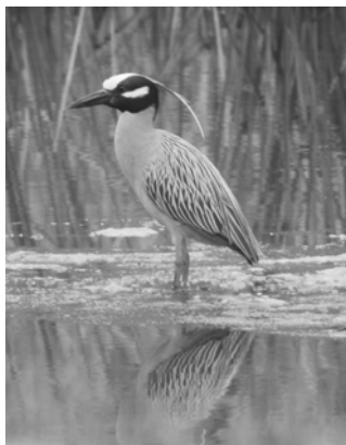
Adult Yellow Crowned Night Heron