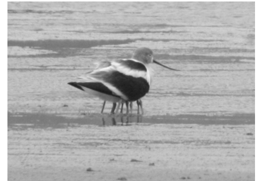
American Avocet and Chicks

Directions: From West Point Loma Boulevard, one long block west of Midway Drive and Sports Arena Drive, turn north at Loma Riviera Drive (at the Riviera Liquor House), and proceed a couple short blocks to the clubhouse on the right. Park on street.